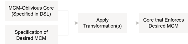
Figure 1: Automation goal: Given a pipeline in our DSL that correctly enforces single-threaded correctness, and a desired MCM, PipeGen automatically creates a pipeline that enforces the desired MCM.

In this work, we create the PipeGen design automation tool to address this design challenge. Specifically, PipeGen enables an architect to design a pipeline in an MCM-oblivious fashion, needing only to enforce single-threaded correctness. The architect specifies the single-core design using a new microarchitectural domain specific language (DSL) that we have developed for this purpose. PipeGen then transforms that pipeline into a multicore pipeline that enforces the specified MCM, as illustrated in Figure 1. A key insight is that we can achieve this automation as code analysis and transformations in a DSL, borrowing methods from compiler design. PipeGen currently uses transformations that encode three different ways of enforcing memory ordering in the pipeline.