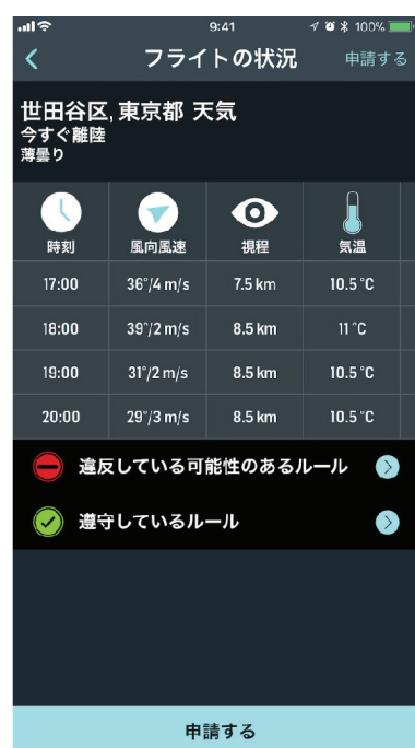
AirMap Contextual Airspace (Japan)

Complete situational awareness for drone operators is critical to the safety and security of the airspace.