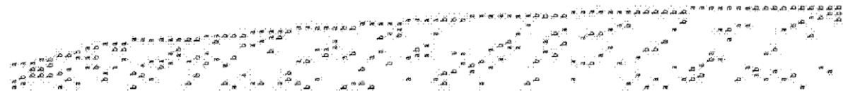
Fig. 1. Translated formula uf20-010.cnf from SATLIB without clause learning.