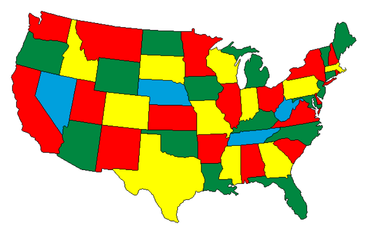
Figure 1 - Map coloring of the states in the U.S. : http://britton.disted.camosun.bc.ca/usamap/map solution.gif

In graph theory, a planar graph is a graph that can be embedded in the plane, i.e, it can be drawn on the plane in such a way that its edges intersect only at their endpoints. An example of a map coloring (planar case) is shown in Figure 1 where neighboring states are colored using different colors.