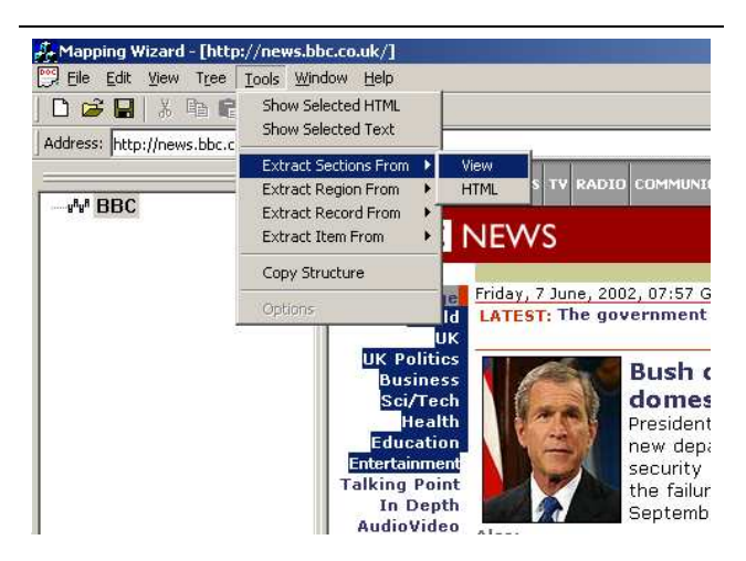
Figure 2: Using the Section Extraction Tool

In most Mapping Rules, the first level of tree nodes is usually a list of links pointing to different pages. For example, in BBC Online News, the first level tree nodes are Sections such as "World", "UK" and "Business", each of which points to its own webpage. The links of these Sections exist in the homepage of the website and are located close to each other within a small area. The Section Extraction Tool is developed to handle this special case by attempting to figure out