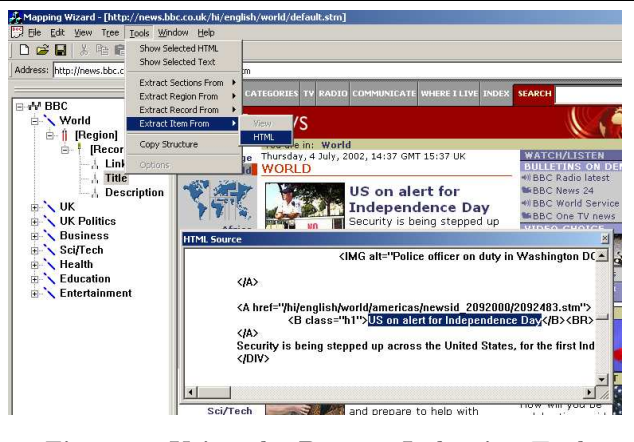
Figure 1: Using the Pattern Induction Tool

mand. In the background, the Mapping Wizard will detect what portion on the browser view is highlighted and invoke the HTML Source View Synchronizer internally to determine the corresponding HTML source. It then applies an algorithm to derive the starting pattern and ending pattern that enclose this part of the HTML source.