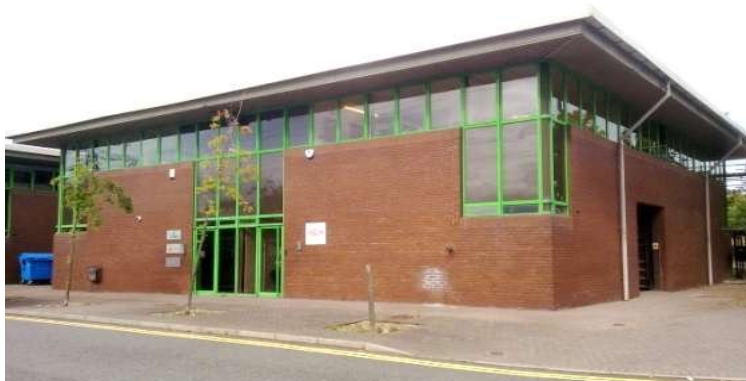
The new Jaguar Heritage premises at Fairfield Court

Seven Stars Industrial Estate, Wheler Road, Coventry CV3 4LJ